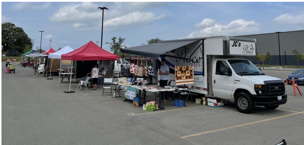
JC's Place Ministry Van on Location West Lincoln Farmers Market